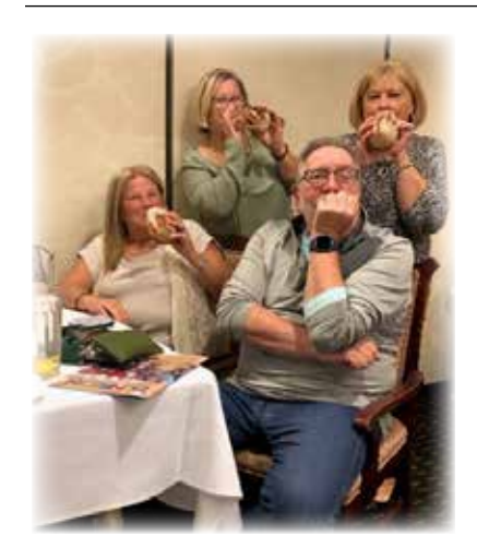
Dave's Angels