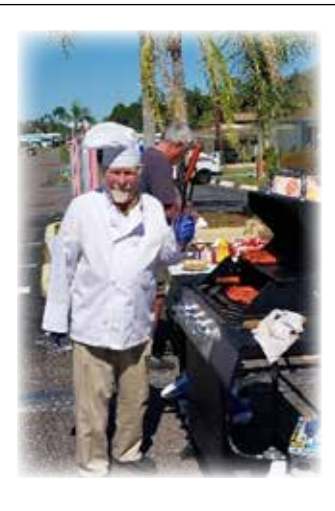
Fred's Hot Dogs